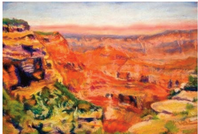
Windy Afternoon Below Cape Royal