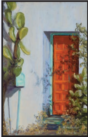
Barrio Door Becky Neideffer Painted in plein air