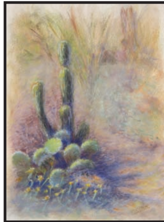
Sonoran Desert Hike Christy Olsen

Chirstoy Olsen is showing "Sonoran Desert Hike", pastel on board (9"x12"), at the Arizona Sonora Desert Museum 2011 Student Art Show & Sale, Baldwin Education Building Gallery at the Desert Museum, October 29, 2011 ~ January 13, 2012, Reception Saturday November 19 from 2 to 4 pm (Photo)