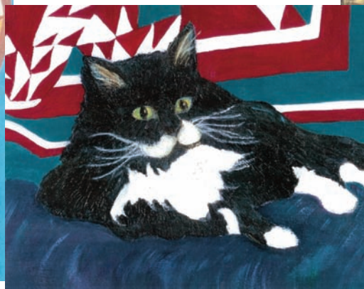
Fat Cat's Christmas