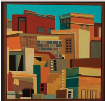
Architectural Composition Judith Kramer